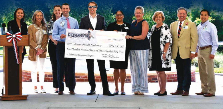
Second Year Grant from Brad Keselowski's Checkered Flag Foundation to Fund Veterans Recognition Program

With gratitude, The Atrium Health Cabarrus Team and Brad Keselowski's Checkered Flag Foundation